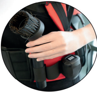
Waistbelt tool storage

Battery indicator and power switch at your fingertips