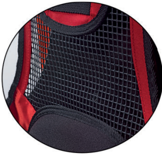
Breathable mesh panel