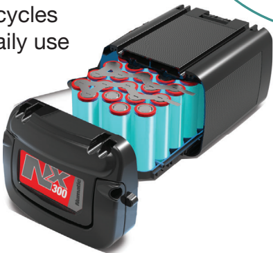
Easy battery change