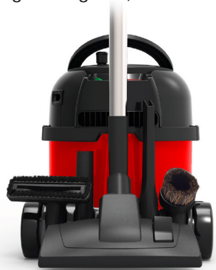
On-board Tool Storage